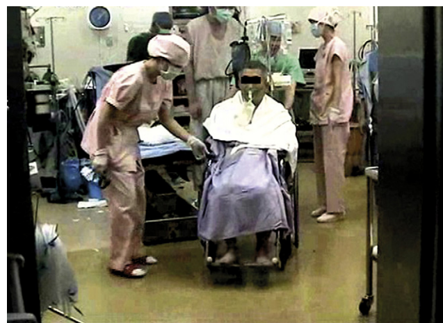
Fig. 2. The patient is completely awake, leaving the operation room in a wheelchair.

Postoperative recovery was compared between 67 patients in the awake OPCAB group and age-matched patients in the GA group. The time to drinking water was significantly shorter ( p < 0.05 ) in the awake OPCAB group ( 4.1 \pm 2.9 h) than in the GA group ( 15.1 \pm 3.7 h). The time to walking also tended to be significantly shorter ( p < 0.05 ) in the awake OPCAB group ( 8.2 \pm 2.9 h) than in the GA group